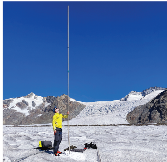
Figure 2. On Konkordiaplatz, in the middle of the Great Aletsch Glacier, over 6 meters (about 19.7 feet) of ice melted down in the summer of 2022—as the view up to the end of the measuring pole impressively illustrates.

But that’s not all: Glacial disasters such as the glacier collapse at Marmolada in the Dolomites kept us on our toes. On Sunday, July 3, 2022, an avalanche of ice and rock suddenly broke off and buried 11 mountaineers in the Italian Alps. The event came completely unexpectedly; such a break-off had never been observed at this