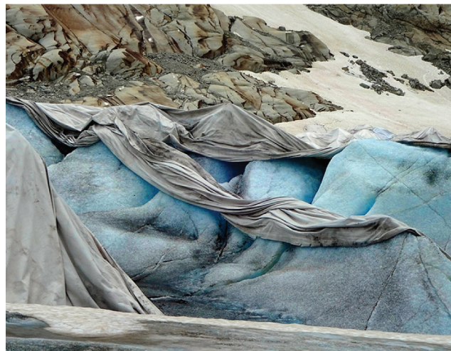
Figure 4. Top: The effects of glacier coverage with tarpaulins at the Rhône Glacier, Switzerland are short-lived. When first installed, approximately 4 meters (a little over 13 feet) of ice melt had been prevented over the course of 12 months. Bottom: Unfortunately, after a few years, these geotextiles become dirty and torn and no longer have any helpful effect.